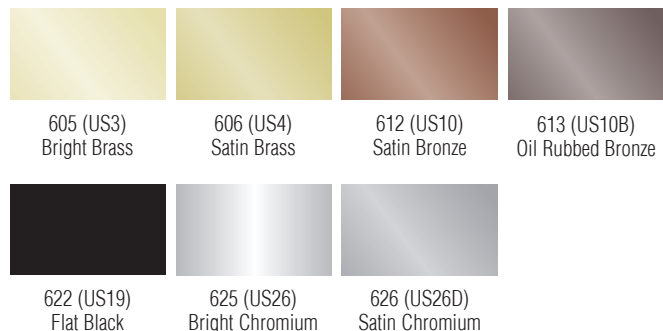
605 (US3) Bright Brass