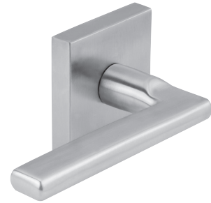
SQUARE ROSE SHOWN WITH ORLANDO LEVER