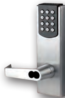
KEYPAD STANDALONE LOCKS